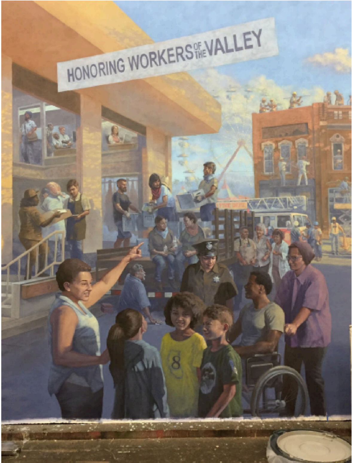
Union Park Mural 180" x 180" - 2017 - Fresno, CA