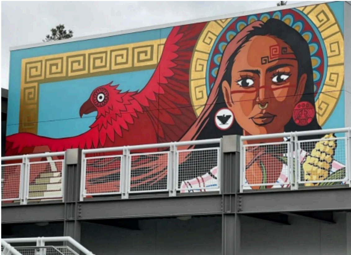
La Chica De Oro 2024 - Madera, CA